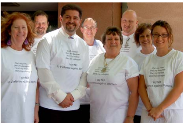
In the photo are Councillors, members of the Action Team and colleagues at Council's white ribbon day event.