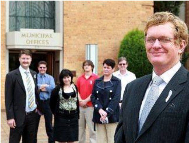
Photo taken from an article printed in the Heidelberg Leader of White Ribbon Action Team members in November 2009, marking White Ribbon Day at Banyule City Council

In 2009 a White Ribbon Action Team was formed to pursue the goals of the White Ribbon Campaign. Action team members came together from a range of council areas and continue to work together to develop a whole of council approach towards Preventing Violence against Women in Banyule.