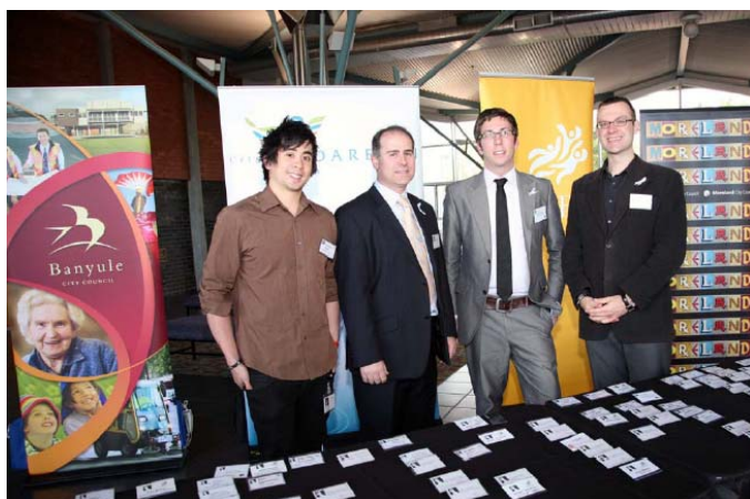
Banyule, Darebin, Moreland and Yarra Councils hosted Not Violent, Not Silent breakfasts in August and October 2008