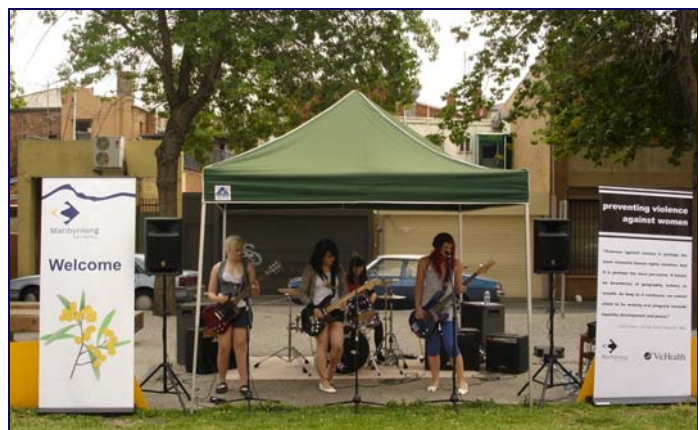
Above: Young people performing at WRD 2010

Leading up to the event Western Region Health Centre (WRHC) staff attended a WRWG meeting to discuss ways to work together. We shared our WRD activities and resources and invited WRHC to march to the