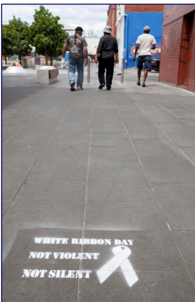
Left: 2010 White Ribbon stencil in Maddern Square

A large community music event and barbeque was held in Maddern Square to mark WRD in 2010. Over 200 people attended the event, which was hosted by the deputy Mayor (now Mayor). To organise this event, the WRWG drew on their relationships across the organisation. Logistically the group organised road blocks, notice to traders in the area, the use of electricity off the main line, transporting the BBQ's, setting up the stage, purchase and preparation of the food from local vendors, requisitioning a food permit, hiring the marquees and pack up of the event. We worked with staff from areas that don't traditionally see their role in PVAW such as the Senior Transport Engineer, Occupational Health and Safety Officer, Coordinator Roads and the Cleansing team.